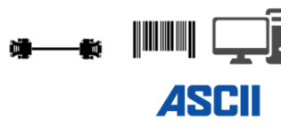
ASCII Scanners, Printers, and ASCII Devices

A Solution, A Philosophy, the RTA Way. We understand the long hours spent on a factory floor and the pressure to keep a line running and product flowing. That's how Real Time Automation came to be. You want easy-to-use solutions where the hardest part is to open the box. You need customer support second to none. If you get all that and a fun customer experience all the better. Thirty years later, our mission remains the same: To move your data where you need it, when you need it, and how you need it.