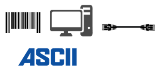
ASCII Scanners, Printers, and ASCII Devices

When you call, a live person answers the phone. When you talk with sales, you will get honest answers and recommendations. When you get support, it is from an engineer who had a hand in the product's development, and support doesn't require a ticket or 24-hour wait.