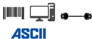
Scanners, Printers, and ASCII Devices

When you call, a live person answers the phone. When you talk with sales, you will get honest answers and recommendations. When you get support, it is from an engineer who had a hand in the product's development, and support doesn't require a ticket or 24-hour wait.