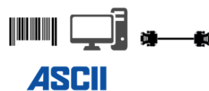
Scanners, Printers, and ASCII Devices

When you call, a live person answers the phone. When you talk with sales, you will get honest answers and recommendations. When you get support, it is from an engineer who had a hand in the product's development, and support doesn't require a ticket or 24-hour wait.